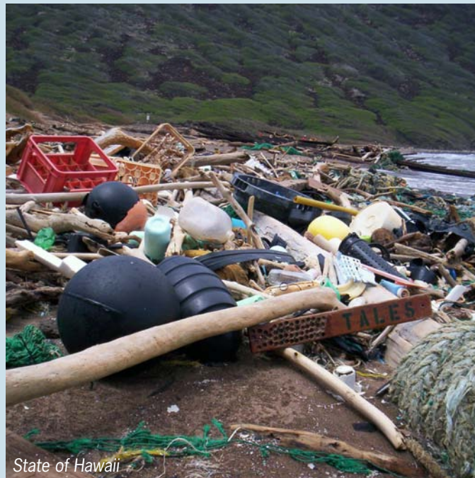
State of Hawaii