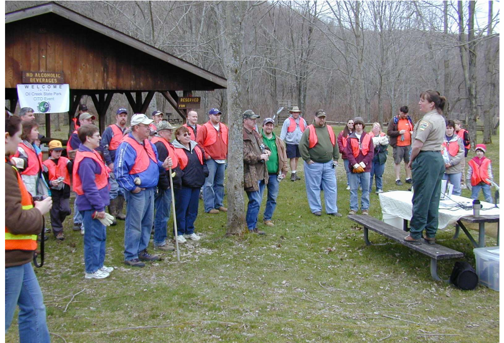
Cleanup strategy & safety guidelines