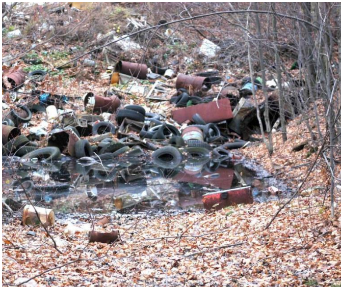
Sproul State Forest

Keep Pennsylvania Beautiful 105 West 4th Street, Greensburg, PA 15601 724.836.4121 | keeppabeautiful.org