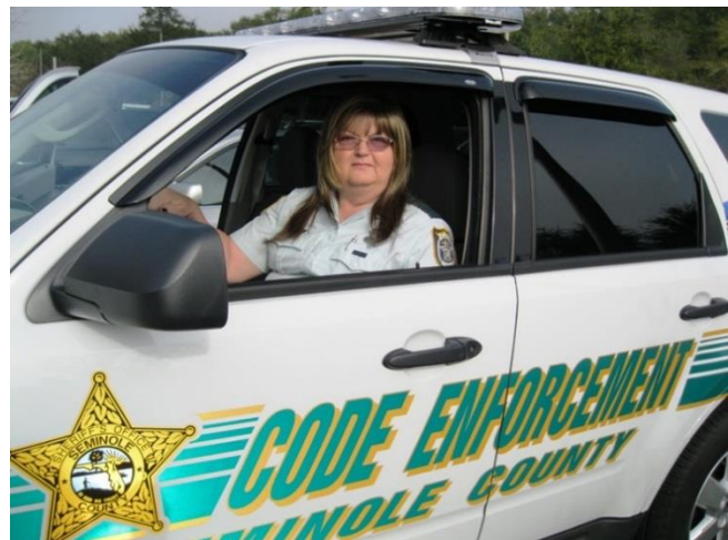
Photo 7: