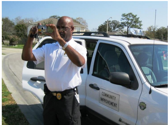
Photo 9: Sanford, Florida Community Improvement

Laws and ordinances can be strengthened and/or clarified to make them easier to understand, ensure they do not conflict with each other, and ensure that their penalties are adequate to deter the illegal behavior. The State of Texas, for example, strengthened their litter/illegal dumping laws about eight years ago such that they now include the potential for felony penalties. This is a strong deterrent, as littering convictions may result in a sentence of over a year in state prison. Similarly, some states have strengthened the penalties for repeat offenders and/or have adopted penalties that accrue on a daily basis (in some cases up to $25,000 per day). This can result in swift compliance, as the offender attempts to avoid large fines. Allowing for more steep penalties for subsequent convictions may also provide an opportunity to focus on education (with some penalty) if a violation occurs, and may serve as a strong deterrent against future violations.