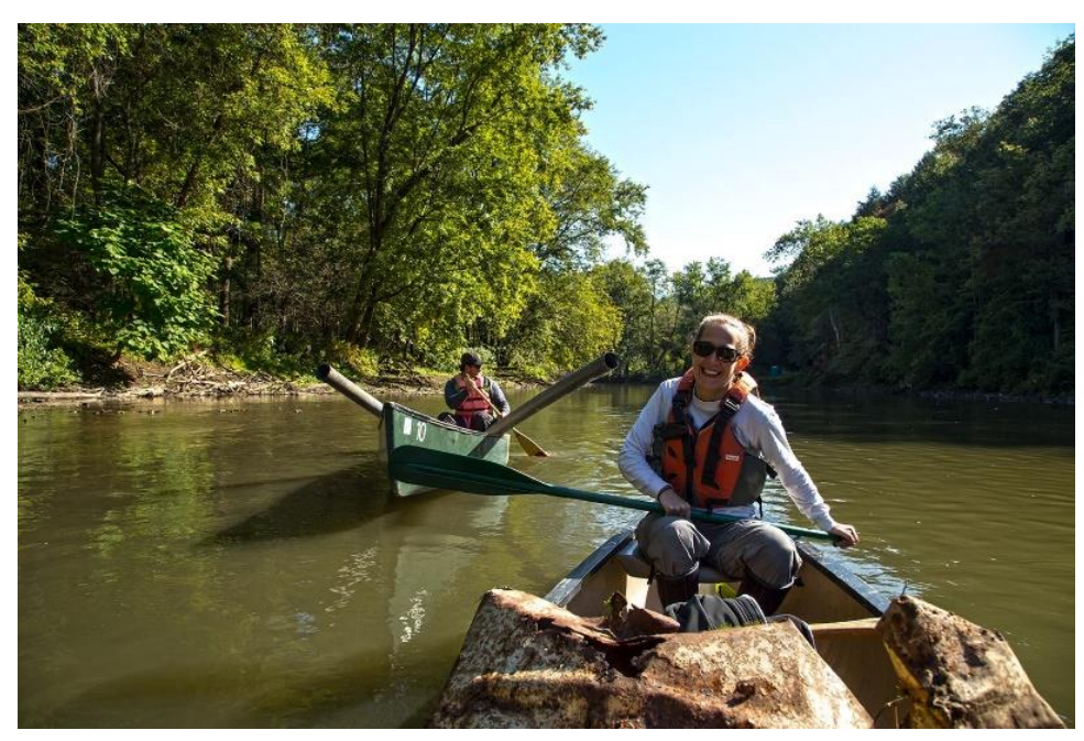
Allegheny River cleanup volunteers.

When defining your cleanup boundaries, keep in mind that the volunteers should not work more than three or four hours. While some may have the strength, stamina and desire to spend a whole day cleaning a stream, the majority will not. You want the volunteers to always be alert. A 9 a.m. start with lunch at noon works well.