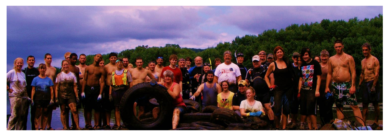
Clinton County CleanScapes volunteers after a cleanup of the West Branch Susquehanna River.

At the end of your cleanup, everyone will be glad they decided to be part of the solution. They'll feel great about the job they've done and they'll probably be surprised at the amount of trash they've removed.