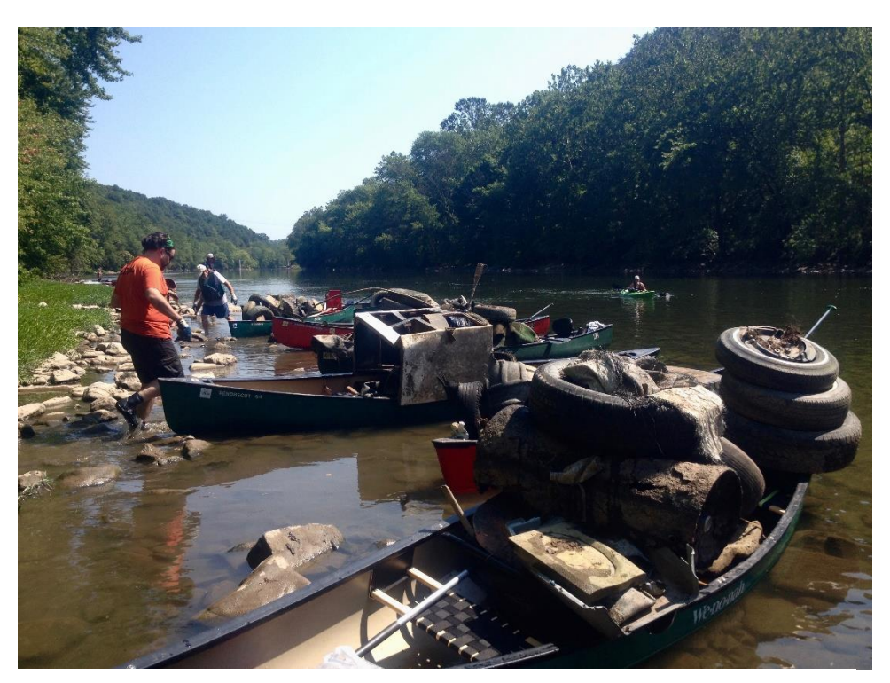
Keep Juniata County Beautiful volunteers clean a section of the Juniata River.