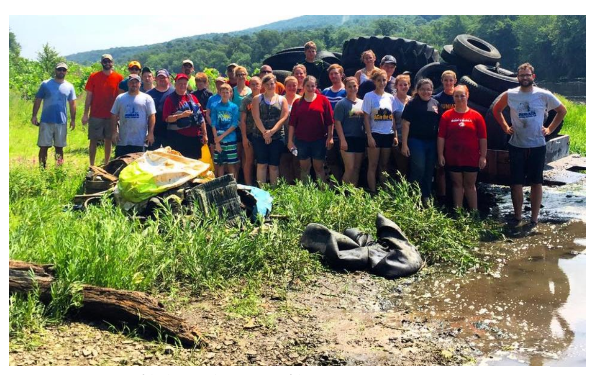
Keep Juniata County Beautiful volunteers clean a section of the Juniata Rive.

By being aware of these tasks ahead of time, your team will have time to plan and address them. Many waterway cleanups have been conducted over the years by dedicated individuals and groups ready to make a positive difference for their environment.