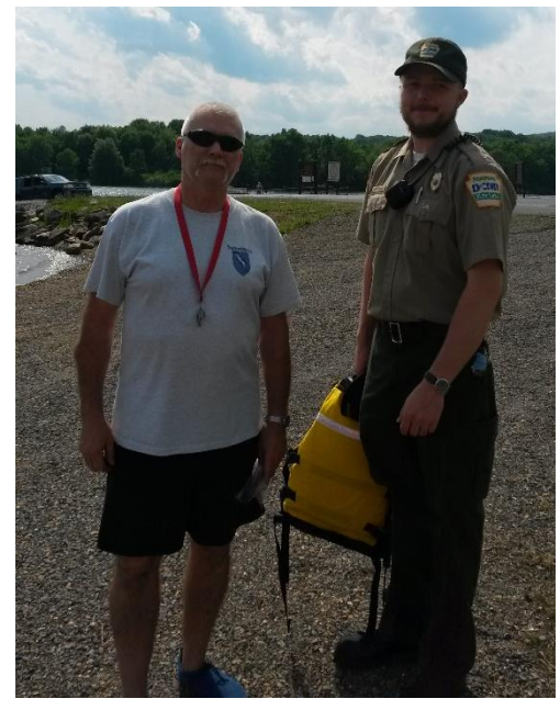
Volunteers and partners work together on waterway cleanups.