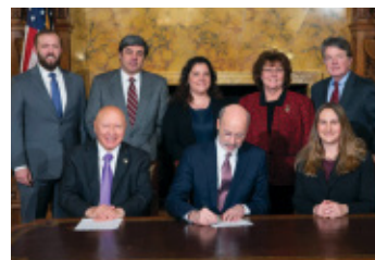
Gov. Wolf signs Act 62 into law