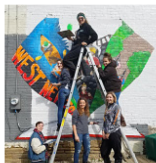
Fresh Paint Days PA, West Newton, Westmoreland County