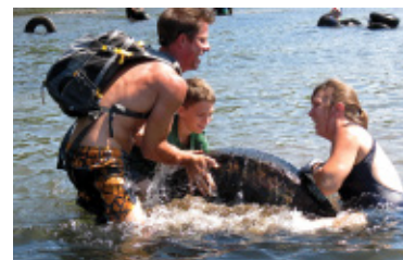
International Coastal Cleanup, Susquehanna County