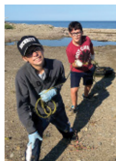
Anheuser-Busch Cleanup, Erie County