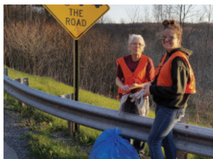
Great American Cleanup of PA, Cambria County