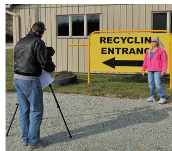
Westmoreland Cleanways and Recycling films recycling video

The Pennsylvania Department of Environmental Protection and Pennsylvania Department of Transportation were awarded the Keep America Beautiful State Agency Partnership Award for their support of Keep Pennsylvania Beautiful statewide programming and the 2020 Pennsylvania Litter Research Study.