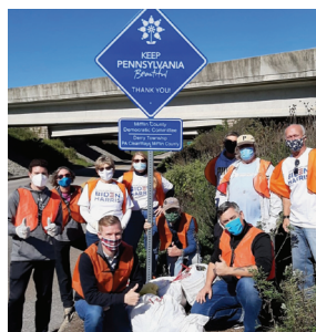
Ort Valley Road Adoption, Mifflin County