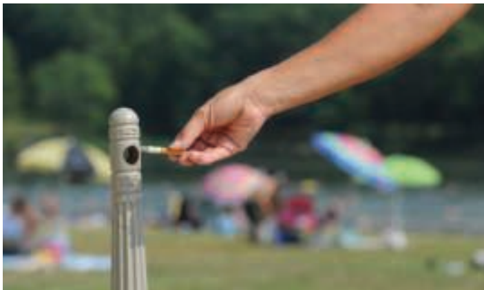
A smoker deposits her cigarette butt into the receptacle near the concession stand at the beach at Keystone State Park.

Through the Cigarette Litter Prevention Program (CLPP), Keep Pennsylvania Beautiful documented a 28.5% reduction in cigarette litter at five PennDOT Welcome Centers. Building off of this success, Keep Pennsylvania Beautiful expanded the CLPP program to five additional PennDOT Welcome Centers located in Mercer, Washington, Greene, Fulton, and Franklin counties and, in partnership with the Department of Conservation and Natural Resources (DCNR), Pine Grove Furnace, Blue Knob, and Canoe Creek State Parks. In addition, Keep Huntingdon County Beautiful was awarded a $1,000 grant to install five receptacles in two parks in Huntingdon Borough and distribute 600 portable ashtrays to park users and others in the area. They have reported an 89% reduction in cigarette litter. Westmoreland Cleanways also received a $1,000 grant to install receptacles at the beach area of Keystone State Park and Twin Lakes Park, part of the Westmoreland County Bureau of parks. They are distributing pocket ashtrays as well. Other Pennsylvania organizations that received a CLPP grant include the Bay Harbor Marina, Erie Yacht Club, and Presque Isle Yacht Club, all in Erie County.