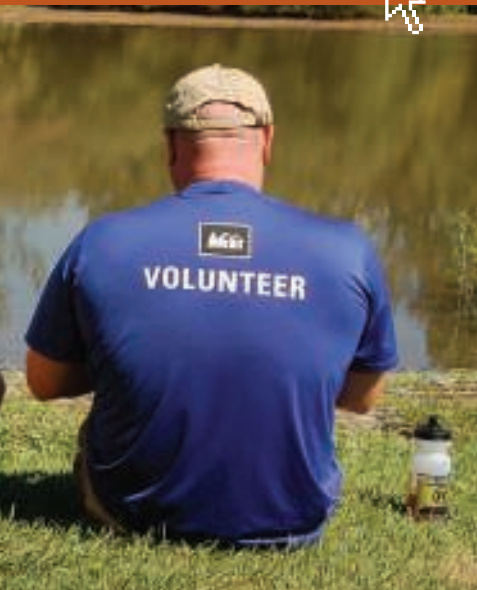
Bedford County volunteer.

For volunteer opportunities go to keeppabeautiful.org .