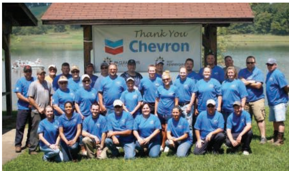
Chevron employees at Dunlap Creek Park.

Allegheny CleanWays partnered with Hollow Oak Land Trust to coordinate a trail improvement project, also on August 2. With the help of 35 Chevron employees, invasive plants were removed and a low-impact walking trail and drainage area was established along the Montour Trail in the Montour Woods and Meeks Run conservation districts in Moon Township.