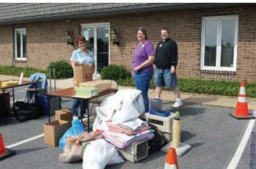
Humane League volunteers collect donations.