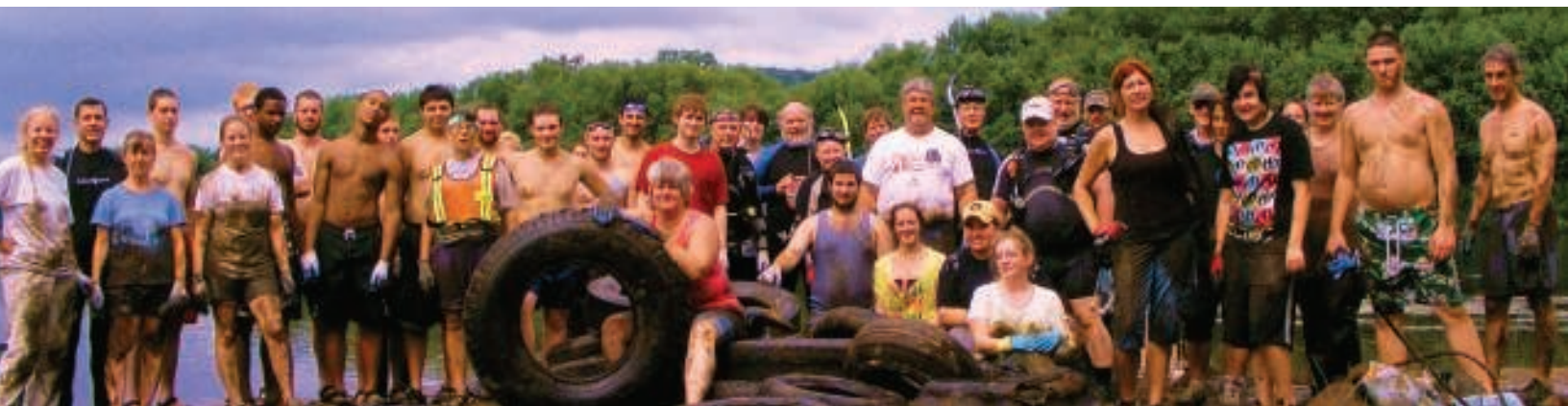
Volunteers removed 4 tons of tires during the 9th annual West Branch Susquehanna River cleanup.

The nationally-recognized West Branch Susquehanna River Water Trail is a 228-mile long waterway that runs through the Allegheny Plateau and the north end of the Allegheny Ridge. Prior to contemporary federal and state waterway regulations, it was the depository for untreated industrial and human waste, and for man-made refuse, such as tires. In 2004 Clinton County CleanScapes began organizing annual summer community river cleanups in Clinton and Lycoming counties. In total, the half-day events have attracted 1,047 participants and have removed 2,983 tires and 68,000 pounds of man-made debris. This year's event took place on July 28. CleanScapes' goal is to remove 85% of all known tires and trash from the West Branch Susquehanna River from their service areas of Clinton and Lycoming counties. Knowing where the tires are and how to safely remove them requires months of detailed planning, financial support, and skilled partners, such as water safety captions, paddlers, and certified scuba divers, to guide the volunteers through the events. The physical act of removing debris from a waterway can be challenging. CleanScapes welcomes interested parties to contact them for additional information at clintoncountycleanscapes@yahoo.com .