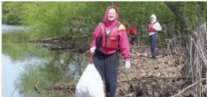
Volunteers bag trash at Magnolia Lake.