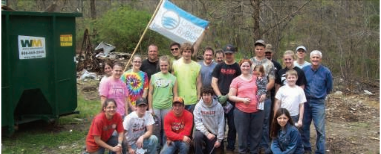
Weishample cleanup volunteers.

On April 21, Keep Pennsylvania Beautiful and United By Blue organized the second cleanup event on Weishample Hollow Road in Barry Township, Schuylkill County. Last fall, over 950 tires were removed from the site and recycled. This spring 20 volunteers removed 9,260 pounds of trash and recycled 3,100 pounds of scrap metal. Tri-Valley High School students and teachers joined United By Blue volunteers and other local residents to sort through the concentrated debris separating trash, tires, and scrap metal. Partners included Waste Management of Camp Hill, CES Landfill (under the Great American Cleanup of PA's Let's Pick It Up PA Days), and Barry Township. Funding was provided by the Department of Conservation and Natural Resources, Bureau of Recreation and Conservation.