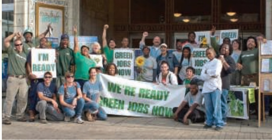
Children join in the fun as Whole Foods announces a public waste oil collection station with GTECH's ReFuel Pittsburgh Program. #2 GTECH organizes supporters of "green jobs" in East Liberty to advocate for investments in the local economy.