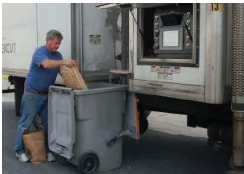
Local resident deposits documents for shredding.

VISIT WWW.KEEPPABEAUTIFUL.ORG TO PURCHASE ITEMS MADE FROM RECYCLED OR ORGANIC MATERIALS.