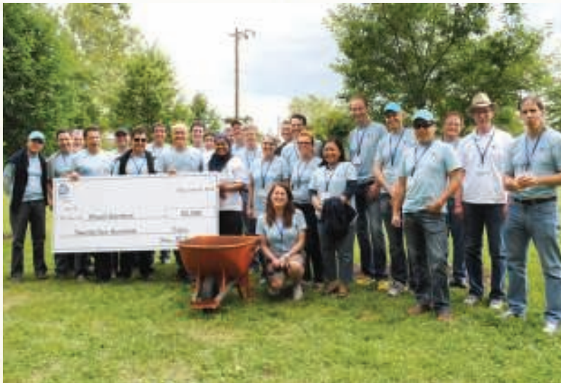
Keep Royal Gardens Beautiful volunteers accept a check from SCA

Svenska Cellulosa Aktiebolaget (SCA) presented Keep Royal Gardens Beautiful with a grant for $2,500 to support their work of invasive plant and litter removal and native plantings. The local Philadelphia office of the global corporation has also donated staff time to the local affiliate.