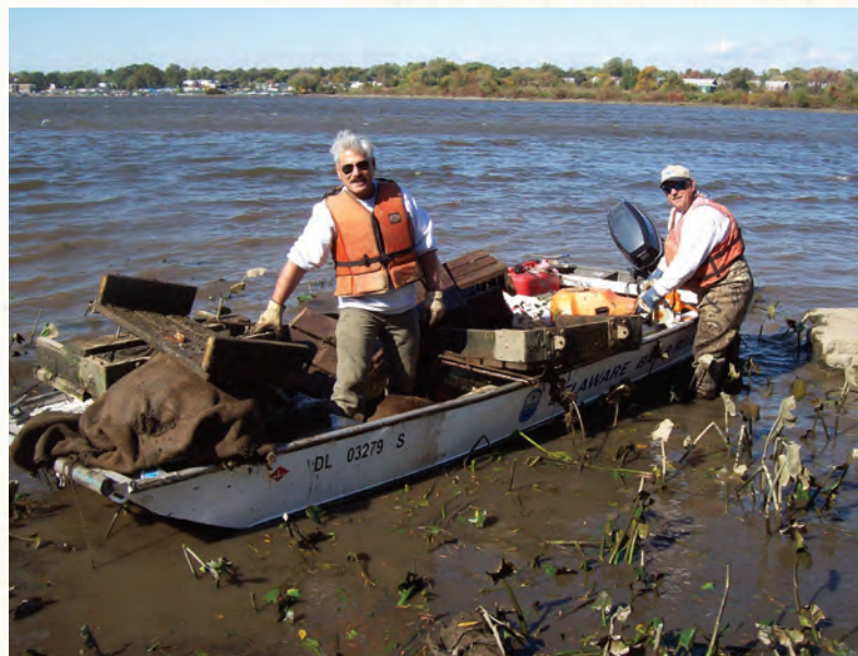
Volunteers prepare to unload their haul.

John Heinz National Wildlife was established in 1972 to protect the largest remaining fresh water tidal marsh in Pennsylvania, which covers 350 acres of the 1,000 acres that make up the refuge. The refuge has five diverse habitats that are home to over 300 species of birds, 85 of which nest there. Many endangered species of amphibians and reptiles are also found in the refuge as well as a wide variety of wildflowers, plants, and mammals.