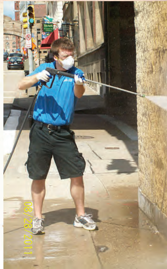
Volunteer power washes storefront to remove graffiti.