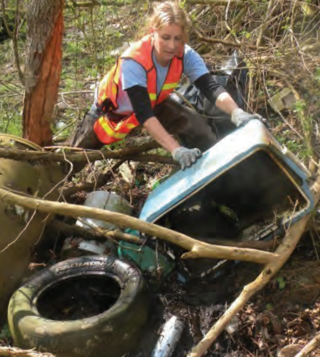
Left: Keep Washington County Beautiful, Washington Valley Road