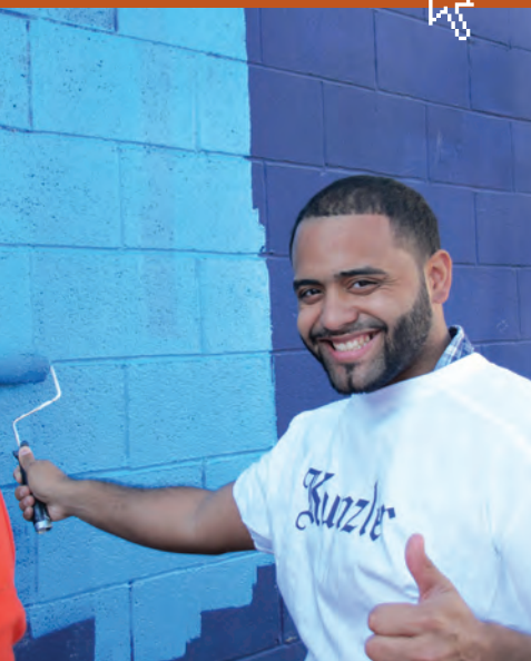
Fresh Paint Days, Boys and Girls Club of Lancaster

For volunteer opportunities go to keeppabeautiful.org .