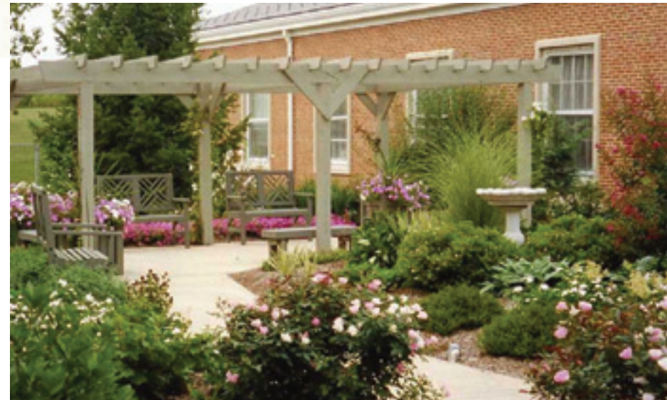
Above: PHS Greening Award Recipient.