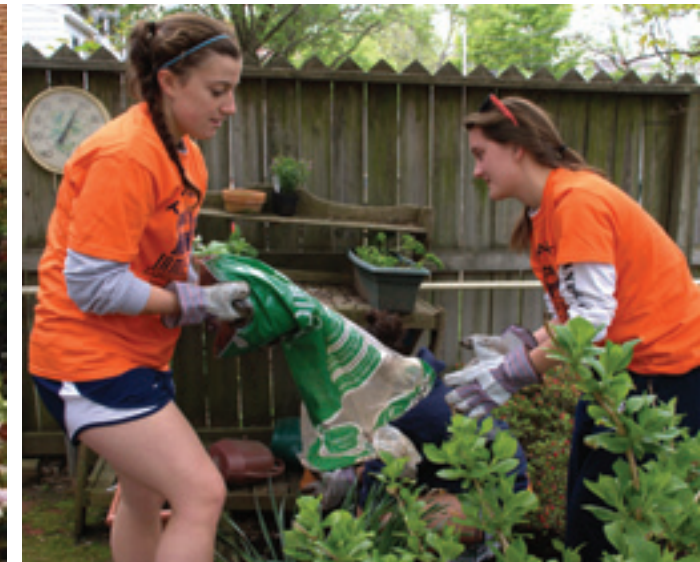
Above: Compliments Keep Lancaster County Beautiful.