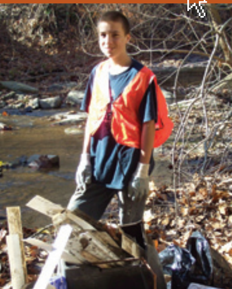
Above: Ferry Road, Fayette County

For volunteer opportunities go to keeppabeautiful.org .