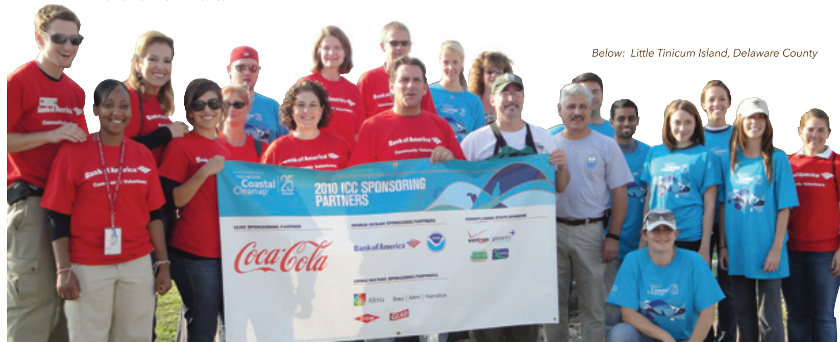
Below: Little Tinicum Island, Delaware County

Keep Pennsylvania Beautiful, Verizon TelecomPioneers, and the Ocean Conservancy again partnered to work together on the 25th International Coastal Cleanup (ICC) to improve coastal and marine environments. Each year more than a half-a-million volunteers from over 100 countries remove millions of pounds of trash and debris from the beaches and waterways across the globe. In 2010, Keep Pennsylvania Beautiful organized 31 International Coastal Cleanup events in five southeastern counties of Pennsylvania. Over 51,000 pounds (25.5 tons) of trash was removed from Bucks, Chester, Delaware, Montgomery, and Philadelphia counties. Also highlighting this worldwide event was a cleanup kick-off event on Little Tinicum Island with support from the Ocean Conservancy and Bank of America.