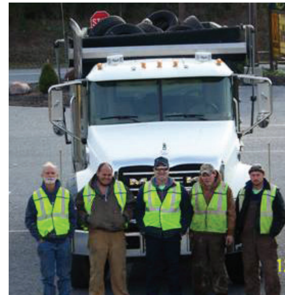
Above: Greater Lebanon Refuse Authority employees and volunteers, Lebanon County.

The latest success story is in Lebanon County. Keep Pennsylvania Beautiful, in partnership with the Greater Lebanon Refuse Authority, surveyed the county in the fall of 2009 and identified 43 dumpsites containing an estimated 72,000 pounds (36 tons) of trash. Through the efforts of citizen volunteers that cleaned sites without telling anyone, five core volunteers that traveled the county cleaning sites, and Greater Lebanon Refuse Authority employees, the county is now free of all roadside illegal dumpsites. One of the last sites cleaned was on Gold Mine Road in State Game Lands 211. It had about 1,000 tires along with assorted trash. A plan is in place to keep the 43 sites clean as they will be getting adopted by volunteers and municipalities for monitoring purposes. In addition, surveillance cameras will be rotated around dumping areas identified in the report to catch future dumpers.