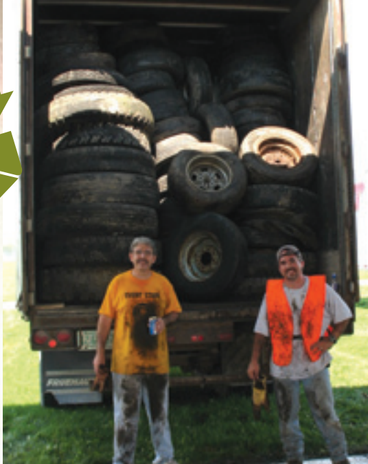
PA CleanWays of Butler-Lawrence Counties

THE LITTER FREE SCHOOL ZONE PROGRAM is designed to encourage students to keep their school grounds litter-free, and to raise public awareness regarding litter via a Litter Free School Zone sign to be displayed outside the school. Students, clubs, classes, and even entire school districts can participate in the Litter Free School Zone program. Keeping their school litter-free is an easy and fun way for students to work together, learning valuable community leadership and responsibility skills while gaining a respect for the environment and the world around them. It is also an opportunity to develop a school-wide stewardship ethic and set a community example.