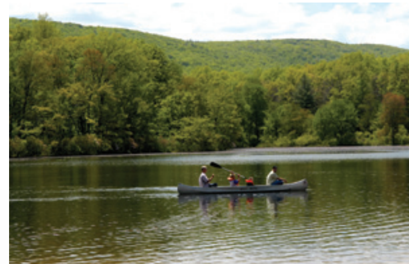
Above: Pine Grove Furnace State Park, Cumberland County

Funding for the grants comes from Keystone Recreation, Park, and Conservation Fund (Key 93), the Environmental Stewardship Fund (Growing Greener 1), the Growing Greener Bond Fund (Growing Greener 2), and federal funding sources.