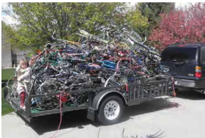
Above: 'Recycled' bike racks installed at the Gering Public Library/Scrapped bikes on their way to a local recycler

Steal This! sponsored by the Steel Recycling Institute, features programs from throughout the KAB national network that we would love to see implemented in your community!