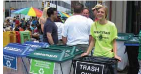
Above: Pennsylvania Resources Council recycling at the Three Rivers Arts Festival

The Coca-Cola/KAB Recycling Bin Grant Program supports local community recycling programs by providing selected grant recipients with containers for the collection of beverage container recyclables in public settings. Through its Zero Waste Pittsburgh (ZWP) event services, the Pennsylvania Resources Council would like to see 100% of special events recycling within the city of Pittsburgh. Thanks to Keep America Beautiful and Coca-Cola, the program received additional bins to meet their goal. In 2010, the Zero Waste Pittsburgh program helped facilitate the recycling of 11 tons of cardboard, 17 tons of commingled recyclables and 59 tons of organics from special events with a combined green house gas equivalent savings of removing 30 cars from the road for one year!