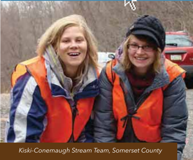
Kiski-Conemaugh Stream Team, Somerset County

Our vision is a clean and beautiful Pennsylvania. It is a vision we all share. A clean and beautiful Pennsylvania means quality of life for our residents, economic development and prosperity in our communities, a sense of pride, and a brighter future for our children.