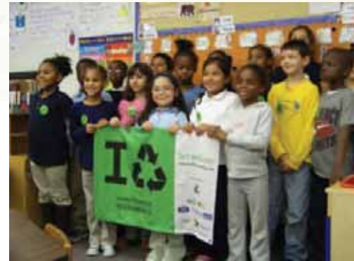
Keep Cobb Beautiful Marietta, GA.