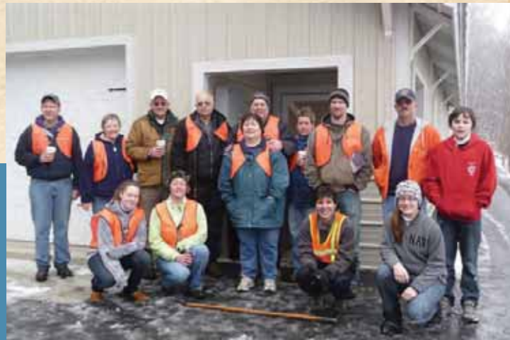
Above: Sweet Root Road Litter Crew