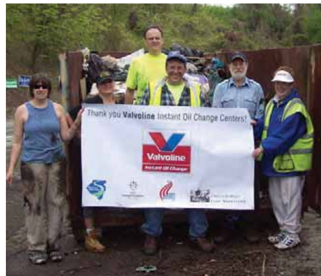
Lincoln Road cleanup crew

Through a grant from Valvoline and Keep America Beautiful, Keep Pennsylvania Beautiful, Allegheny CleanWays, and the Crescent Hills Civic Association worked together to coordinate a cleanup on Lincoln Road in Penn Hills Township on May 7 th . Seven volunteers removed 12,520 pounds of trash and 170 tires. An additional 416 tires have been removed by the Allegheny CleanWays Dump Busters who have been working at the dumpsite since the cleanup. Additional trash has been collected and staged at the site to be removed later this fall. The Dump Busters will continue to work at the dumpsite until all the trash is removed. This site is a very active illegal dumpsite and has been an eye sore in the community for years. The Lincoln Road illegal dumpsite has been cleaned several times by the township in the past and Allegheny CleanWays is working with the county and local government to stop future dumping. The grant from Valvoline is associated with their new oil NEXTGen. Fifty percent of NEXTGen is recycled oil which has been re-refined.