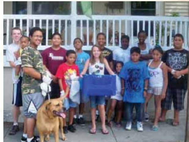
Above: The Breck Squad.

Pennsylvania Downtown Center is a statewide nonprofit that provides outreach, technical assistance and educational services in order to assist communities like Olde Getty Place in revitalizing their central business districts and surrounding residential neighborhoods. To learn more visit www.padowntown.org .