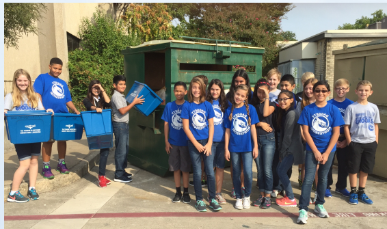
Daggett Montessori School (Ft. Worth, TX)