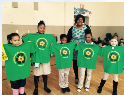
Kirkpatrick Elementary School (Clarksdale, MS)