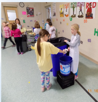
Allenstown Elementary School (Allenstown, NH)