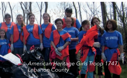
American Heritage Girls Troop 1747, Lebanon County