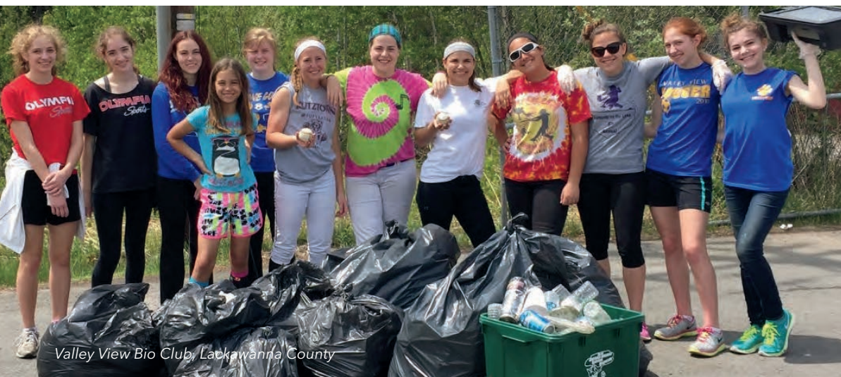
Valley View Bio Club, Lackawanna County