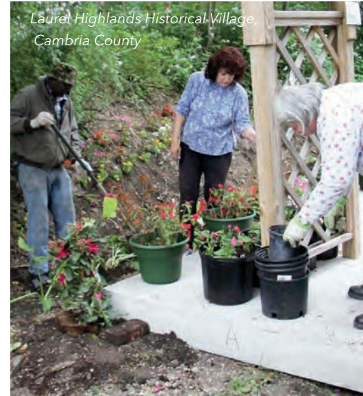
Laurel Highlands Historical Village, Cambria County