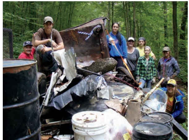
Elk County community volunteers with their haul.