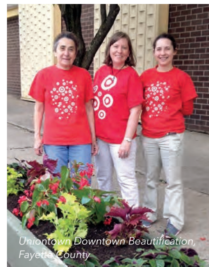
Uniontown Downtown Beautification, Fayette County