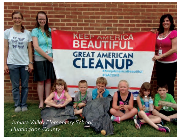
Juniata Valley Elementary School, Huntingdon County