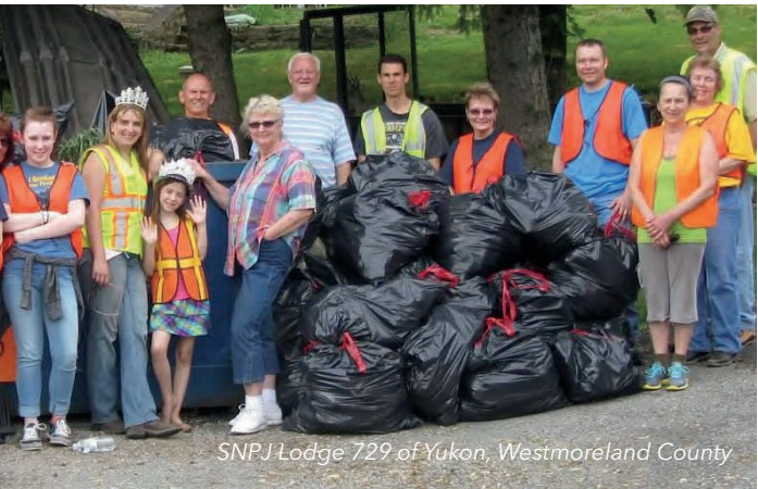
SNPJ Lodge 729 of Yukon, Westmoreland County