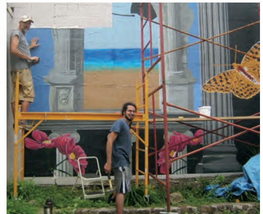
West Reading Elm Street