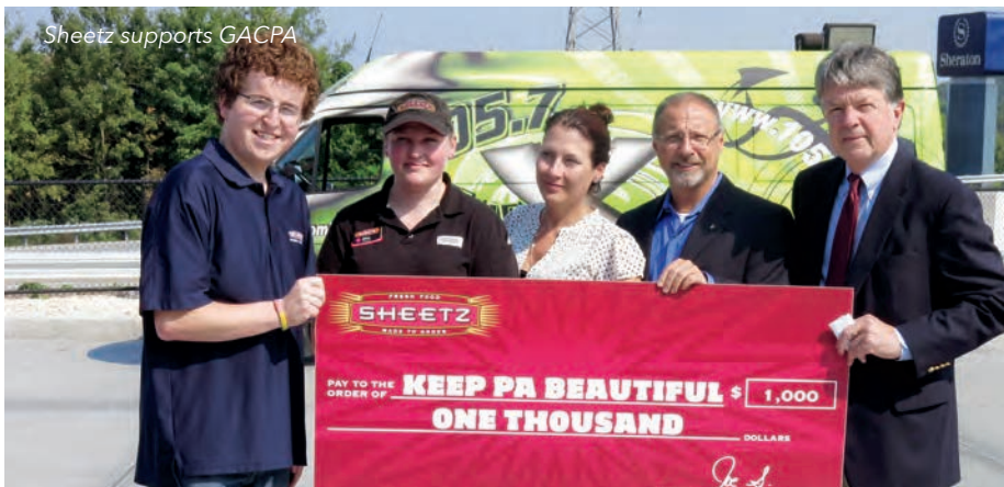
Sheetz supports GACPA