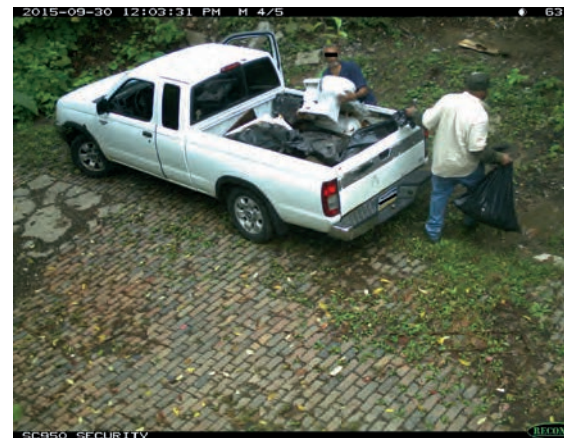
Top: Women deposits broken TV at Wesleyville Borough Recycling Center Bottom: Two men unload their vehicle in Allegheny County