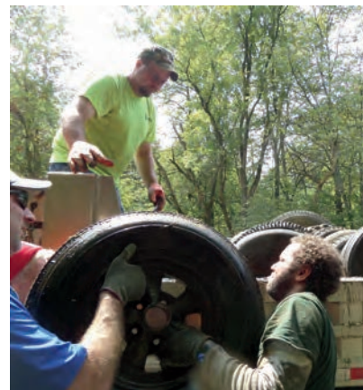
Allegheny Aquatic Alliance