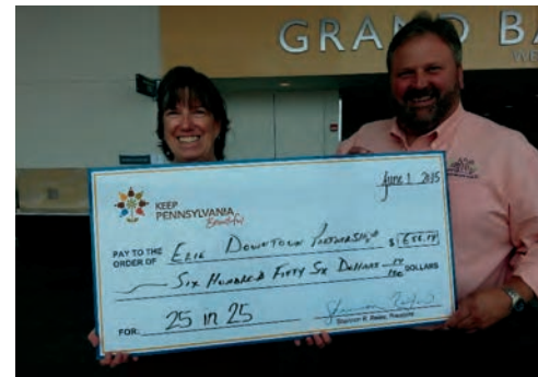
Erie Downtown Partnership

Keep Pennsylvania Beautiful's 25 in 25 Grant Program was created in recognition of the organization's 25th Year Anniversary. KPB provided 25 grants in 25 days to celebrate 25 years of building clean and beautiful communities. The projects were a tremendous success and included diverse grassroots initiatives that ranged from butterfly gardens to public space recycling. Across the Commonwealth volunteers removed trash and tires from miles of streams and trails. Dedicated community members planted thousands of native plants, trees, bulbs, and flowers. Educational trail signage was built, rain gardens and outdoor classrooms were created all while involving and educating thousands of youth. Through this program, more than $250,000 worth of community match was invested in communities across Pennsylvania.