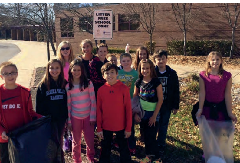
Haine Middle School students, Butler County.