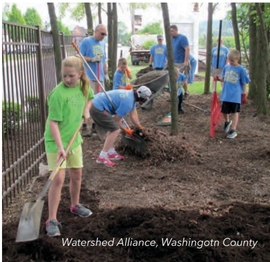
Watershed Alliance, Washington County

"Sheetz is thrilled to partner with Keep Pennsylvania Beautiful. Being connected in the communities in which we operate is an important part of the Sheetz DNA. We encourage our local team members to get out in their local areas and not only be ambassadors for Sheetz, but good members of the community. We believe that what we do now for the state of Pennsylvania is important and will impact future generations."