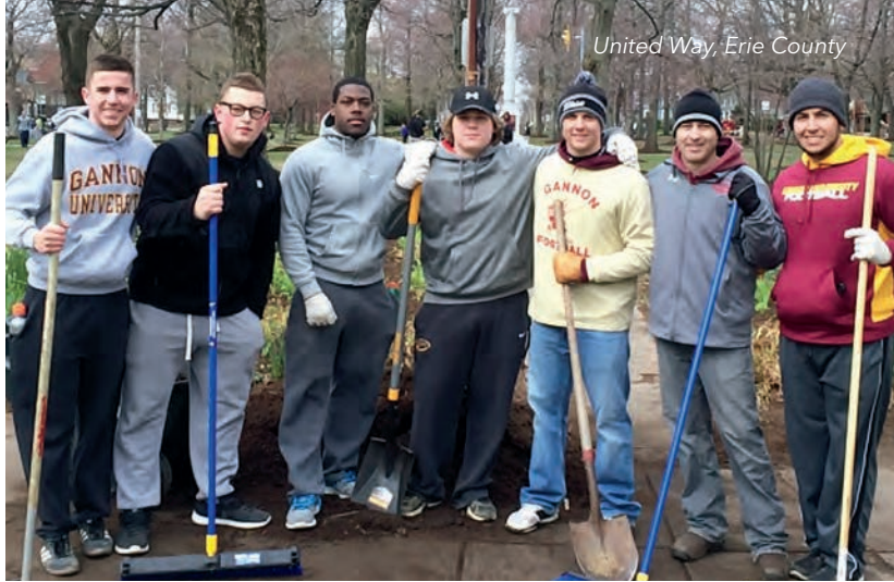
United Way, Erie County