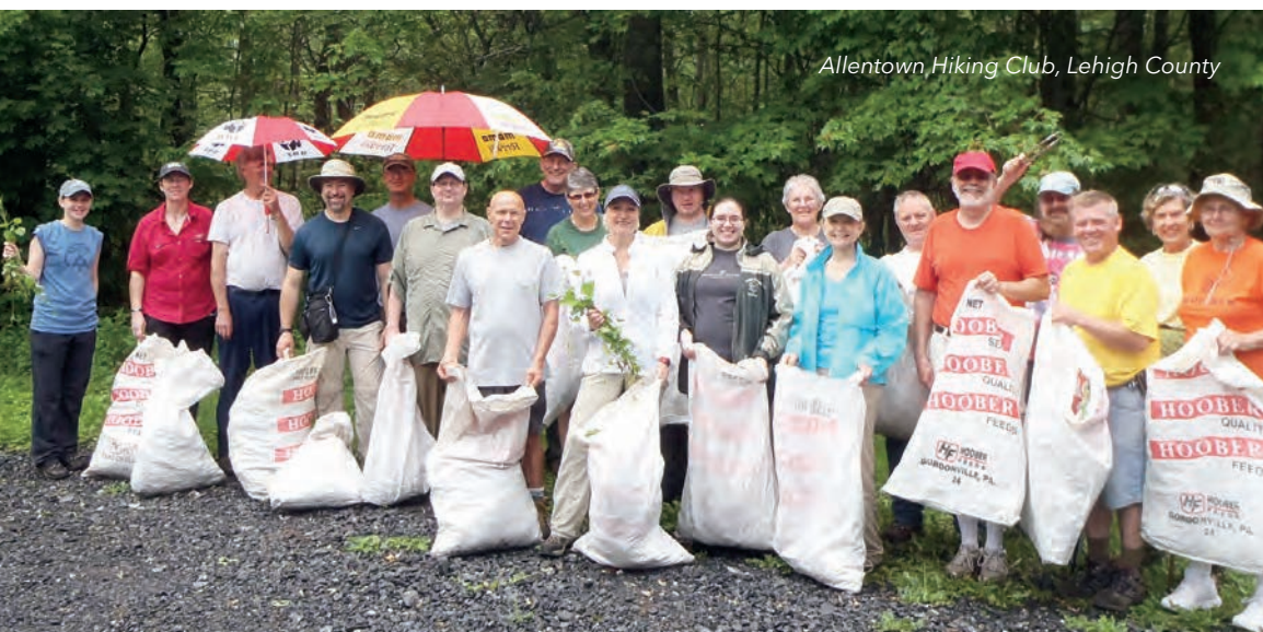
Allentown Hiking Club, Lehigh County