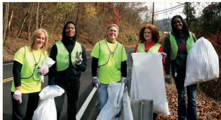
Jefferson Hills Borough road adopters clean Scotia Hollow Road.