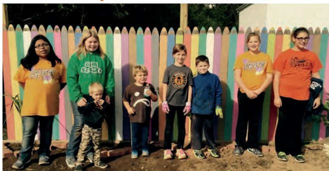
Blairsville Community Development Authority