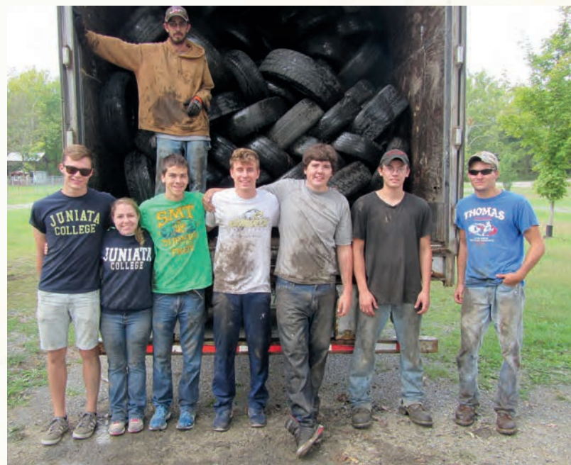
Huntingdon County Tire War volunteers.

1,480 Tires Keep Huntingdon County Beautiful 1,238 Tires Keep Perry County Beautiful 638 Tires PA Cleanways of Mifflin County 508 Tires Keep Juniata County Beautiful