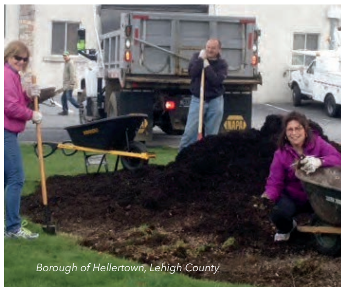
Borough of Hellertown, Lehigh County