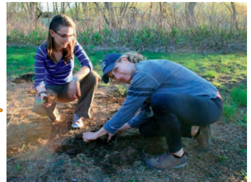
Friends of Milton State Park