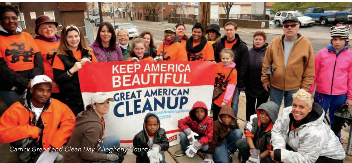
Carrick Green and Clean Day, Allegheny County