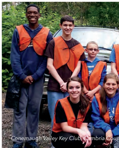
Conemaugh Valley Key Club, Cambria County