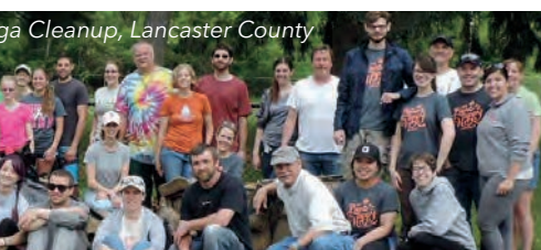
ga Cleanup, Lancaster County

"What happens on the land affects the water and in order to keep the Schuylkill River clean, we need to keep our communities, parks, roads, and neighborhoods clean. By registering a cleanup or volunteering for one, anyone can help create a healthy Schuylkill River and a beautiful Pennsylvania."