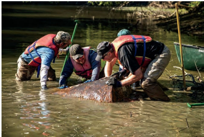
Allegheny River Cleanup volunteers remove a metal drum from the river.