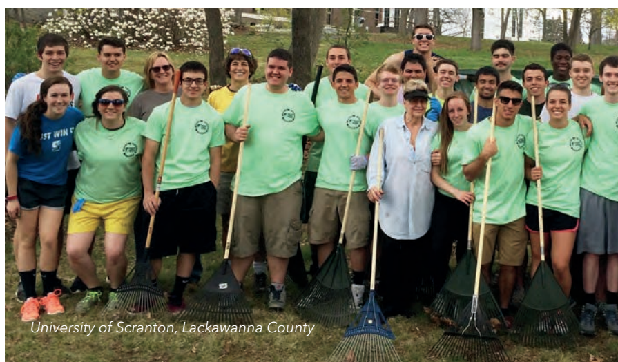
University of Scranton, Lackawanna County