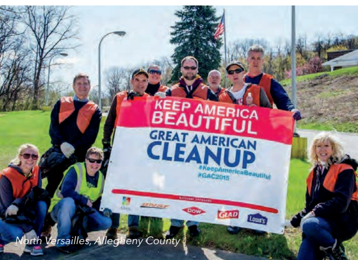
North Versailles, Allegheny County