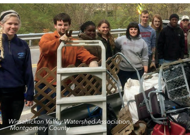
Wissahickon Valley Watershed Association, Montgomery County

"This important partnership with Keep Pennsylvania Beautiful will considerably expand the environmental impact of Project Clean Stream. It's an exciting opportunity for more people and more communities to take action and join our cleanup efforts and also gain a deeper appreciation for why it's so critical to care for the environment and keep their local streams healthy."