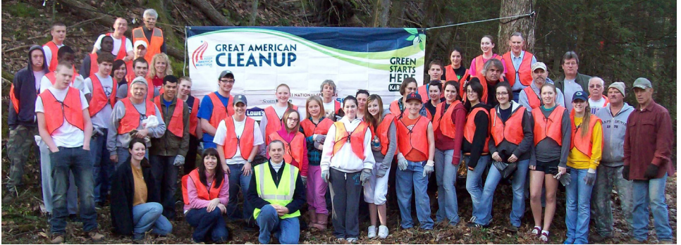
Above: Volunteers at Gorsuch and Ponderosa Roads cleanup, Huntingdon County. Below: Volunteers from Home Depot improve an outdoor space at the VA Pittsburgh Healthcare System's H.J. Heinz Campus.

All 67 counties in Pennsylvania were represented in the Great American Cleanup of PA in 2012. There were 4,421 events involving 141,264 volunteers. Volunteers collected 338,148 bags of trash or 6,762,960 pounds. They cleaned 13,589 miles of roads, railroad tracks, trails, waterways, and shorelines, and 14,046 acres of parks and or wetlands. Additionally, volunteers planted 22,511 trees, bulbs, and plants in an effort to keep Pennsylvania beautiful.