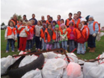
Stroudsburg Roadside Cleanup, Monroe County

All 67 counties in Pennsylvania were represented in the Keep Pennsylvania Beautiful Great American Cleanup of PA in 2011! There were 4,222 events involving 159,922 volunteers who collected 7,085,340 pounds of trash from 13,140 miles of roads, railroad tracks, trails, waterways, and shorelines, and 5,887 acres of park and/or wetlands. Additionally, volunteers planted 3,321 trees, bulbs, and plants in an effort to keep Pennsylvania beautiful.