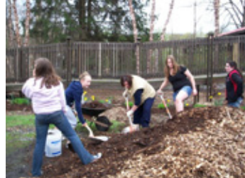
Christy Mathewson Park, Wyoming County