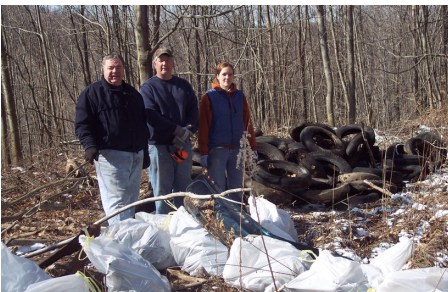
PA CleanWays of Mifflin County collected 4,840 pounds of trash and 100 tires at Looker Mountain Trail.

The Clean & Green Fund allows Keep Pennsylvania Beautiful to allocate resources where they are needed most in meeting our mission and assisting local volunteer affiliates with their programming efforts. These funds are available for direct costs of cleanups, such as tire disposal, Freon removal, and landfill space. This fiscal year, these funds helped pay for the proper disposal of 337,260 pounds of trash, 1,210 pounds of electronics, and 3,379 tires. Nine chapters requested and received money to help pay for the costs associated with 13 separate events.