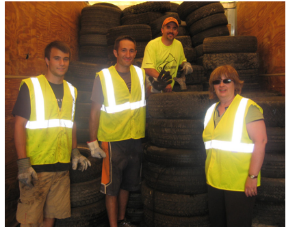
PA Cleanways of Butler-Lawrence Counties