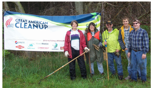
Keep Washington County Beautiful volunteers removed 100 pounds of trash and 10 tires from Sichi Hill.