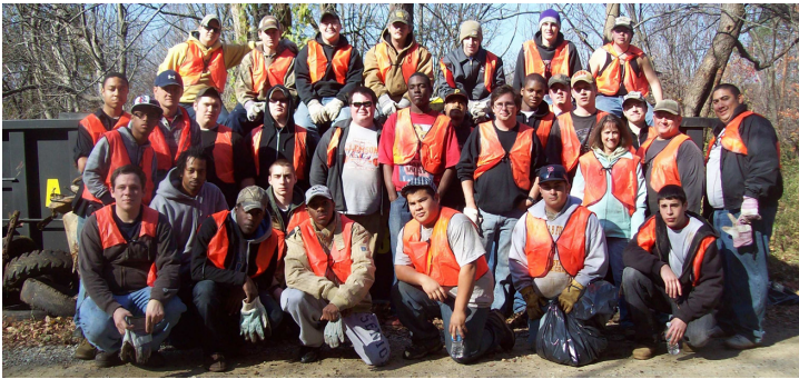
Buterbaugh Road, Indiana County

Keep Pennsylvania Beautiful's goal of a cleaner Pennsylvania began in 1990 with a comprehensive and strategic approach to cleanups that involves the local community. Local involvement creates a sense of ownership and commitment that is needed to monitor illegal dumping activity that helps keep sites trash free. This fiscal year, Keep Pennsylvania Beautiful, its affiliates, and legions of volunteers removed 14,266,620 pounds of trash from our hillsides, trails, roadways, and waterways. Keep Pennsylvania Beautiful works primarily on public lands using volunteers or equipment and sometimes both. With the help of local partnerships providing valuable resources and people who want to make a difference, Keep Pennsylvania Beautiful is proud to be making progress towards a cleaner, safer place for all Pennsylvanians.