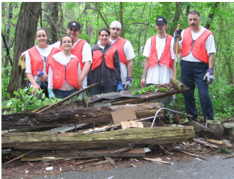
Hazelwood Greenway, Allegheny County

Cleaning up a littered site or an illegal dump is only half the battle – keeping it clean is the other part of our mission. Through the Keep Pennsylvania Beautiful Adoption Program, individuals are empowered to take a lead in their community by organizing friends, family members, co-workers, and others to