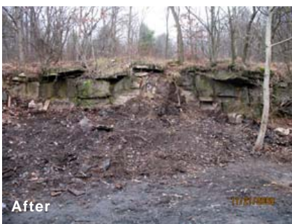
Spruce Lane, Somerset County - 68.2 tons of trash, 172 tires