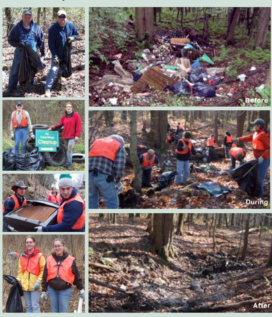
Annual Report October 1, 2008 - September 30, 2009