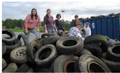
PA CleanWays of Huntingdon County collected PA CleanWays of Fayette County volun-441 tires at this year's tire collection.

The PA CleanWays grassroots network spends a considerable amount of time and resources soliciting local support for direct cleanup costs. The Clean and Green Fund was developed to help our chapters and affiliates pay for services that are often difficult to get donated, such as tire disposal, landfill space, and freon removal. This fiscal year, these funds helped pay for the proper disposal of 10.99 tons of trash, 1,417 tires, and 75 appliances. Six chapters requested and received money to help pay for the costs of 8 separate events.