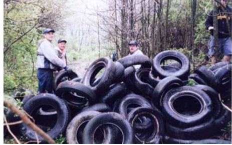
teers removed 439 tires from Shadyside Road.