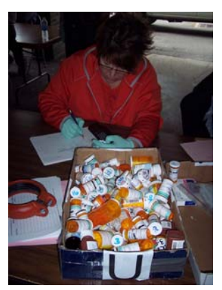
PA CleanWays of McKean County volunteer collects information from prescription bottles brought to the collection.

PA CleanWays works to increase the availability of convenient, affordable disposal for certain items, such as tires, household hazardous waste, appliances, and electronics. Our affiliates and chapters often work with local solid waste and recycling offices to identify local disposal needs and coordinates collections of those materials that might otherwise be dumped illegally. This fiscal year, through special collection events, PA CleanWays has collected and properly disposed 13,698 tires, 695 appliance, 33.5 tons of scrap metal, and 25.4 tons of electronic waste.