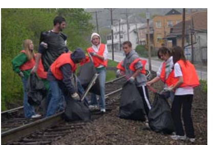
Allegheny County - South Fayette Twp. Community adoption.