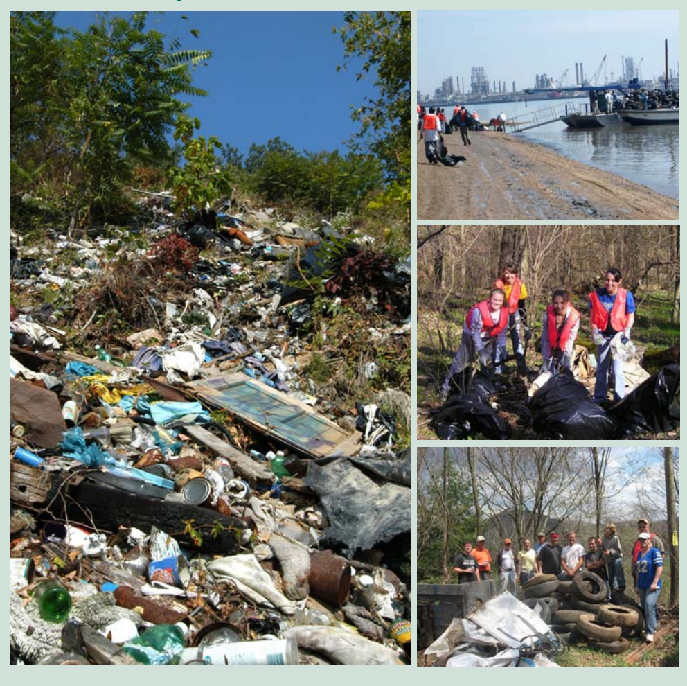
Annual Report October 1, 2007 - September 30, 2008