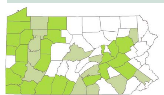
Counties shaded dark green indicate a completed PA CleanWays illegal dump survey. Light green indicates surveys in progress.

As part of our goal to continue a comprehensive and strategic plan for cleanup and abatement of illegal dumping in Pennsylvania, we continue to identify and assess sites through the illegal dump survey program. Through this program, sites are assessed for content, location, and size. GPS coordinates are recorded and used to plot the sites. The results of the dumpsite surveys are used to prioritize projects and illustrate the scope of the problem. To date, PA