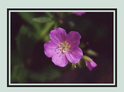
"They say time changes things, but you actually have to change them yourself." Andy Warhol

PA CleanWays 105 West 4th Street • Greensburg, PA 15601 724-836-4121 • www.pacleanways.org