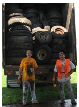
PA CleanWays of Butler-Lawrence Counties collected a total of 21 tons of tires this fiscal year.

Both large urban areas as well as rural communities can experience illegal dumping problems if waste collection systems are less than ideal. Special collection events are a positive approach for dealing with hard-to-dispose items and provide residents with an opportunity to legally and environmentally dispose of materials that are no longer needed or useful.