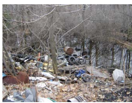
4.67 tons of trash and 1,050 tires were removed from Mill Run Watershed by PA CleanWays of Blair County.

To support our grassroots network, the Clean and Green Funds are allocated to local chapters where they are needed the most, to help with the direct costs of cleanups and special collections. This fiscal year, these funds helped pay for the proper disposal of 12.4 tons of trash, 5,676 tires, and 27 appliances. Six chapters requested and received money to help pay for the costs of 11 separate events.