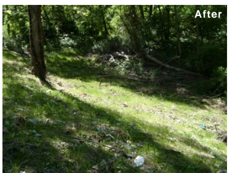
Old US 30, Bedford County - As part of the Beautification Program, this site was seeded and mulched under the PA Cleanways comprehensive cleanup plan.