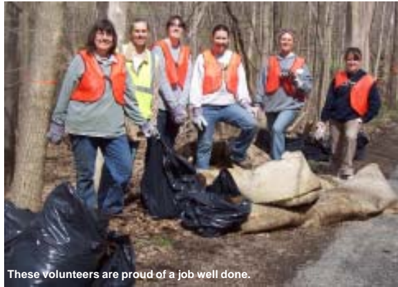
These volunteers are proud of a job well done.

On April 14 th , PA CleanWays of Washington County partnered with PA CleanWays - Keep Pennsylvania Beautiful home office staff to organize and clean a stretch of road near Finleyville in Peters Township. Extra assistance provided by Lawver Tire Disposal at the site helped remove 64 tires, a large refrigerated display case and rolls of heavy, wet carpeting. Peters Township provided man power and dump trucks to load and haul