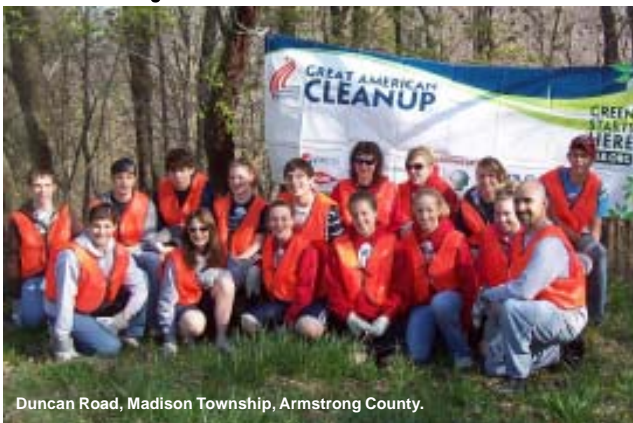
Duncan Road, Madison Township, Armstrong County.