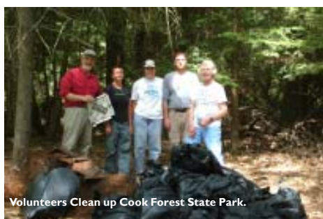
Volunteers Clean up Cook Forest State Park.

A 23-mile section of the Clarion River stretching through Elk and Forest counties has been officially adopted by the proprietor of Cook Riverside Cabins, Inc., located in Cooksburg, PA.