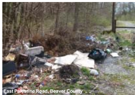
East Palestine Road, Beaver County