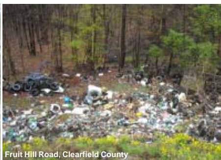
Fruit Hill Road, Clearfield County

PA CleanWays - Keep Pennsylvania Beautiful released reports for 12 counties in July from their Illegal Dumpsite Survey Program. The following counties were surveyed for dumpsites this past fall and spring; Beaver, Blair, Cambria, Cameron, Clearfield, Clinton, Huntingdon, Juniata, Lebanon, Mifflin, Union, and York. PA CleanWays - Keep Pennsylvania Beautiful has surveyed 49 counties, locating 5,098 dumpsites with a total estimated tonnage of 15,805.32 tons. The illegal dump surveys can be downloaded at www.pacleanways.org/IDS/ids_index.html .